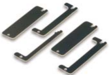
DBK41 CE kit is included with the DBK41 CE version