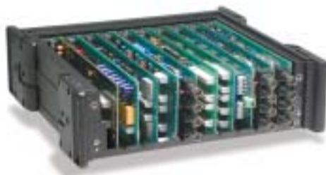
The DBK41 provides slots for up to 10 analog expansion cards