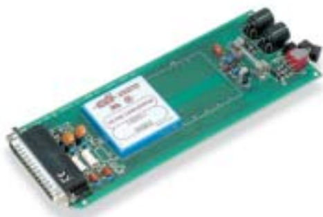
If needed, the DBK41 can be powered by the DBK32A power supply card