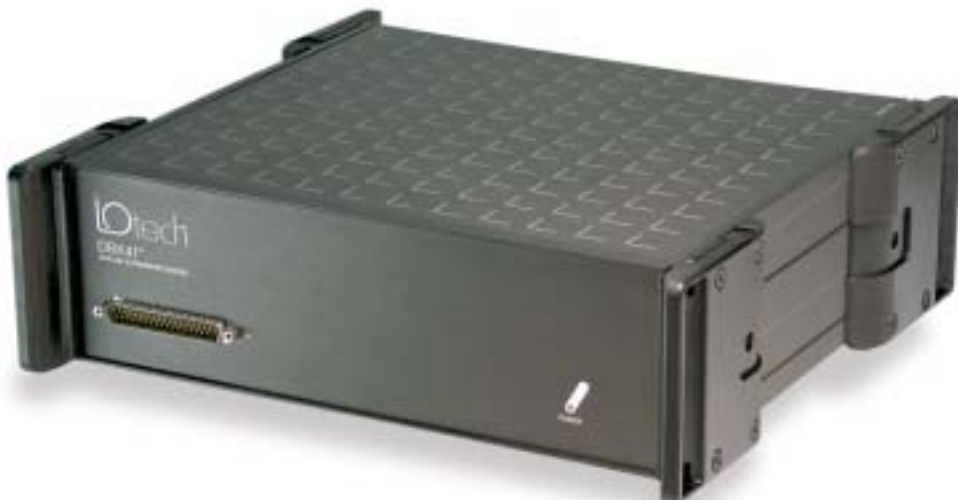
The DBK41 analog expansion module accommodates various analog signal conditioning and expansion cards in one system

The DBK32A™ can obtain its power from a number of sources: an included AC adapter, an optional DBK30A rechargeable battery/excitation module, DBK34 battery/UPS module, or any 9 to 20 VDC source, such as an automobile battery.